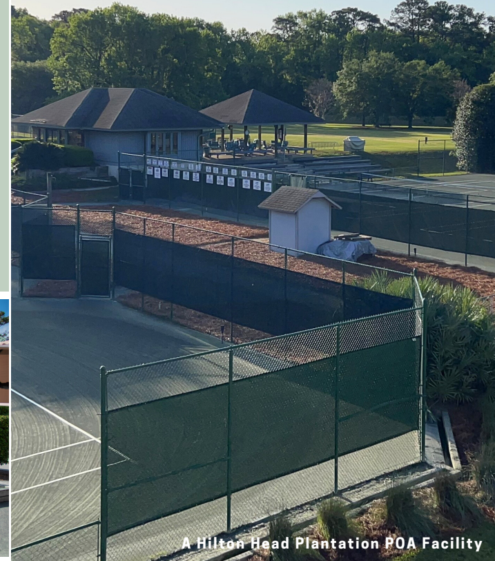
A Hilton Head Plantation POA Facility