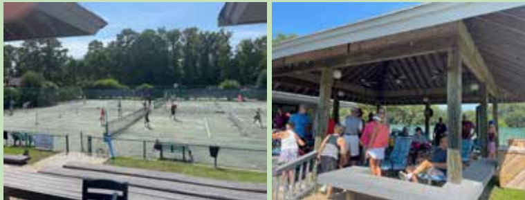
Pictures from Sept. 8th Spring Lake combined tennis/pickleball social.