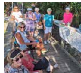
Mangia Con Noi at Pine Island