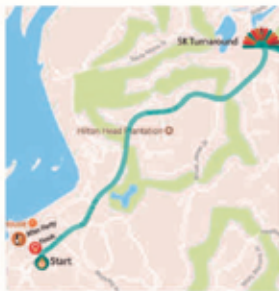
Course Map for 5k, and Fun Walk

The 5k race begins in front of the Skull Creek Dockside at 8am and winds through Hilton Head Plantation until turning around and finishing back at the Skull Creek Dockside.