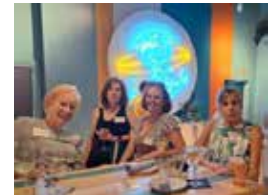
Out to Lunch Bunch at Lucky Beach