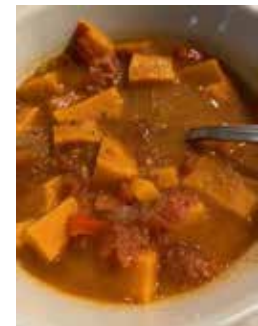
Check out a recipe for Sweet Potato Peanut Stew from Plant Forward