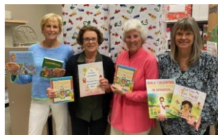
Thank you to our Bible Studies group for the bilingual book donation