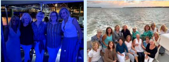
Party for One Club Members enjoyed the Salty Dog Happy Hour Sunset Cruise in September!