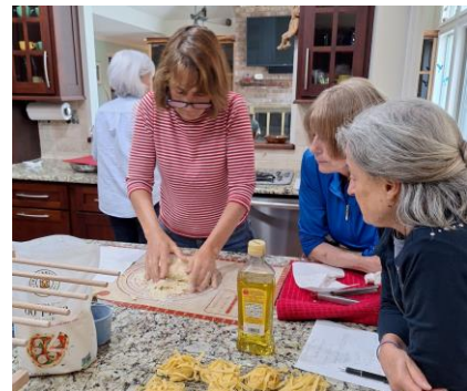
Check our new recipe of the month Fresh Pasta with Bolonase sauce from our Activity Group, Mangia Con Noi, only on our website