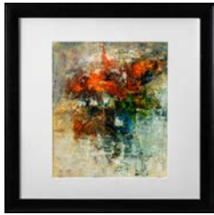
"Adjustable Solutions" Art Cornell

Our Hilton Head Plantation Artists include painters, photographers, sculptors, jewelry and glass designers, as well as fiber artisans. A wonderful representation of artwork was on display and for sale recently at our Fall Art Market. Below is just a sampling.