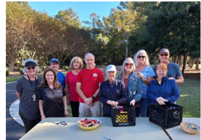
HHPWC Board at Food drive