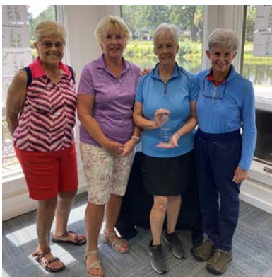
Bottom Left: DHWGA members in the spirit of the Pumpkin Patch Open